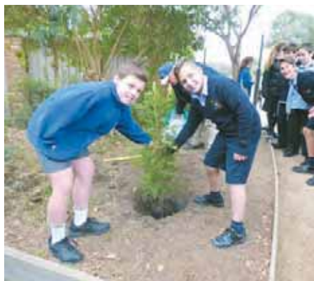
Students from Wonthaggi Primary School and Leibler Yavneh College planting a tree.

But this isn't just about how we perceive them. It's about how they perceive us too.